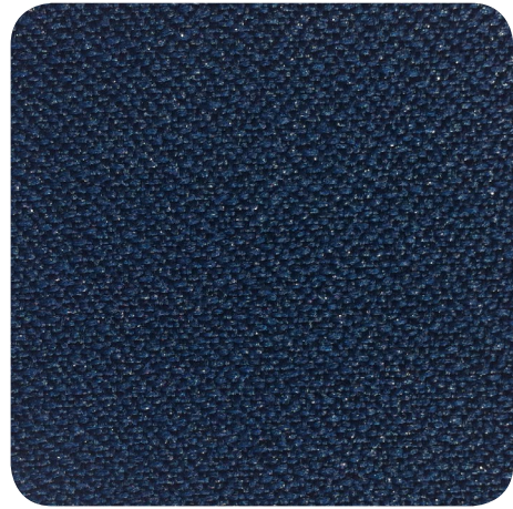
9212 Lapis Blue