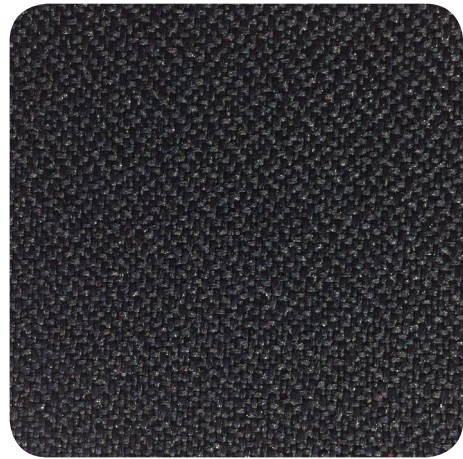
9114 Lead Grey